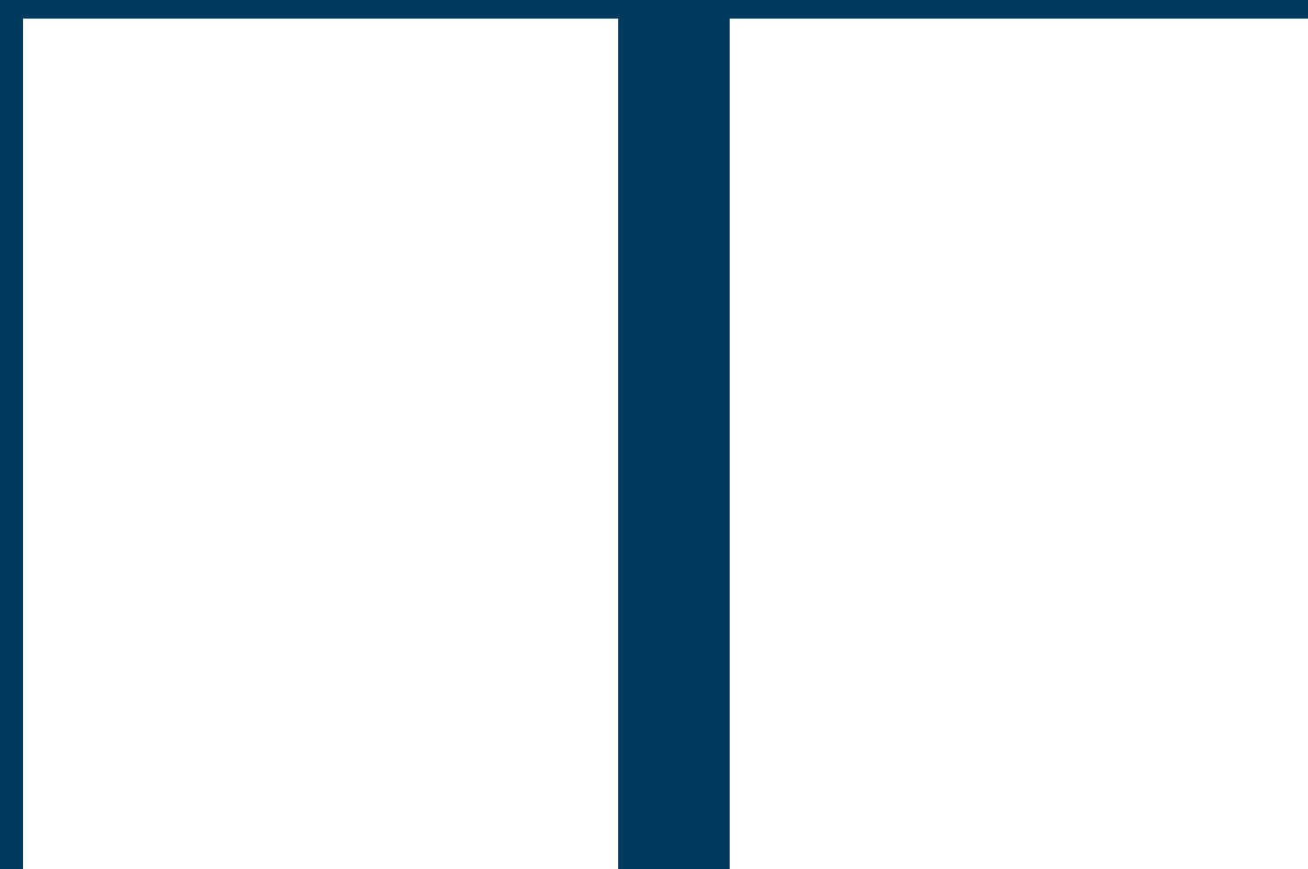
LAYOUT B Two 3.5"x5"